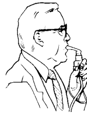
FIGURE 2.2 Using the Nebulizer